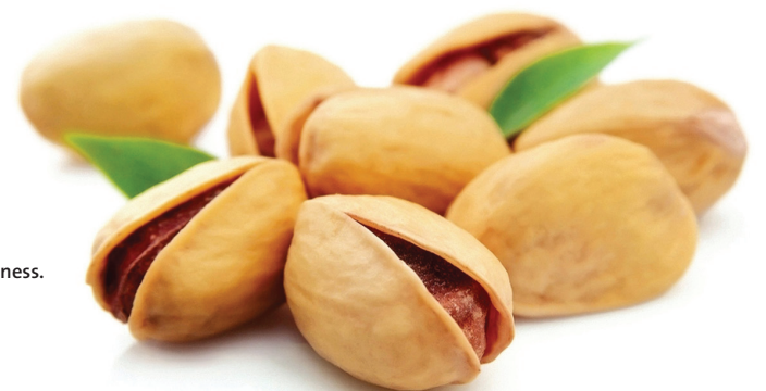
Eating pistachio nuts will bring happiness.

Other flowers and plants that are popular for the Lunar New Year include Peach Blossom, Red Azaleas, bendable bamboo, Pine sprigs and Kumquat trees.