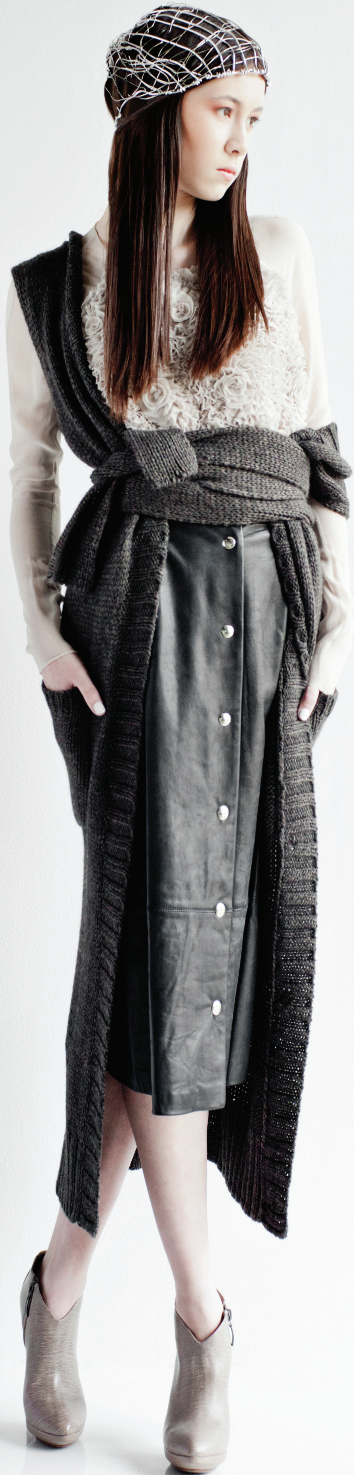
Blouse by Robert Rodriguez $365 Vest by Robbi & Nikki Skirt by Elizabeth & James $895 Booties by Alexandre Birman $585