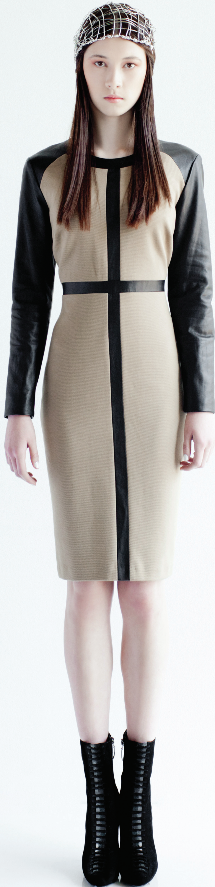
Dress by Robert Rodriguez $545 Booties by Alexandre Birman $750