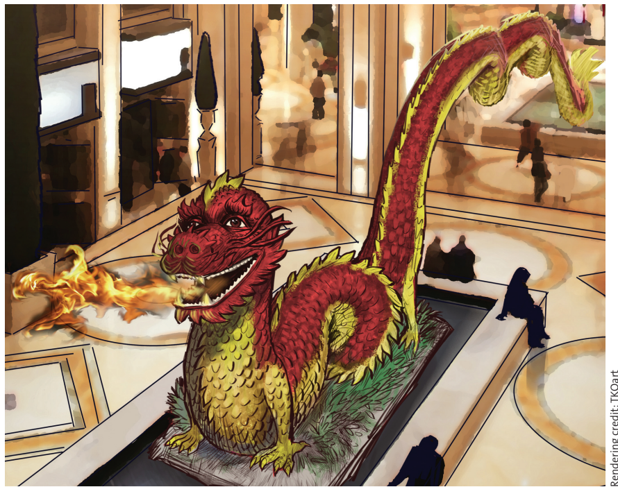
Artist's rendering of the 128-foot fire-breathing dragon, which will be located in the Waterfall & Atrium Gardens of The Palazzo Las Vegas.