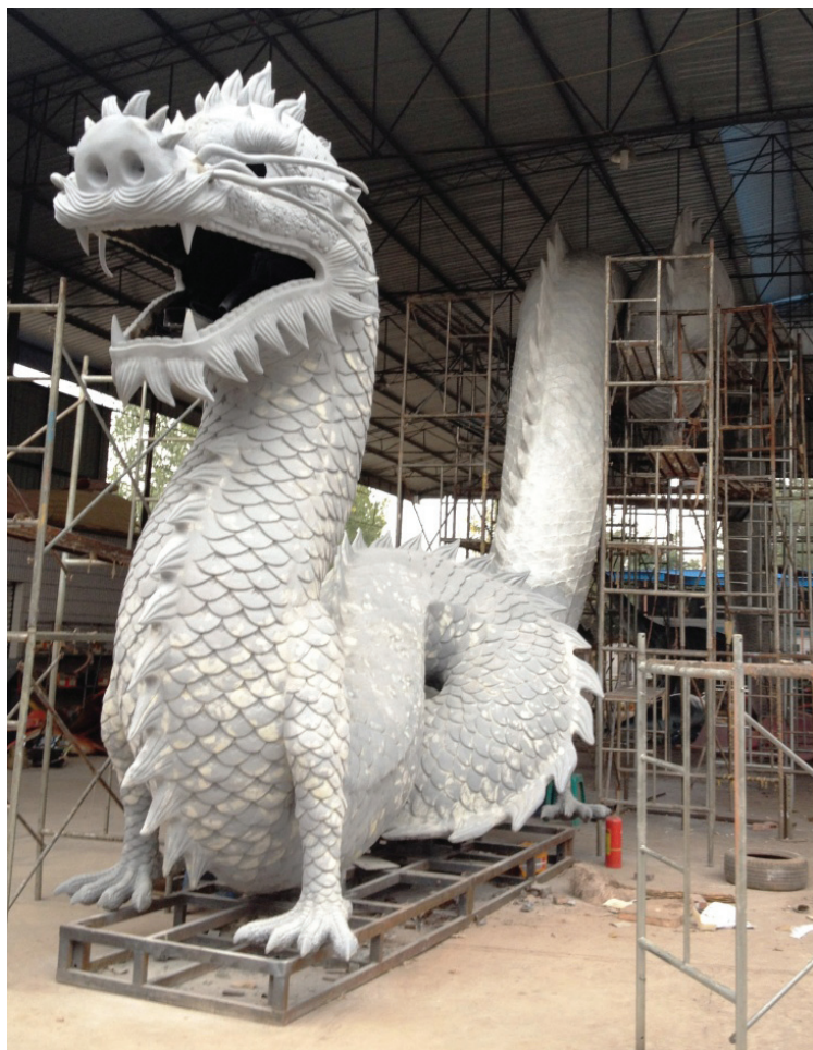
The larger-than-life dragon took more than a year to create and will take nearly 10 days to construct onsite.

A secret friend to the dragon, a rooster will sit to the west of the ground fountain. The two zodiacs are compatible to one another and together bring harmony, wealth and lucky relationships.