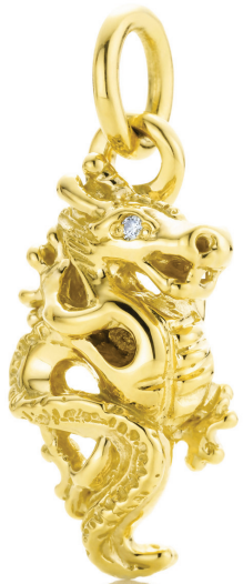
Paloma Picasso Chinese Zodiac Dragon Charm

18k gold with round brilliant diamonds. tiffany.com