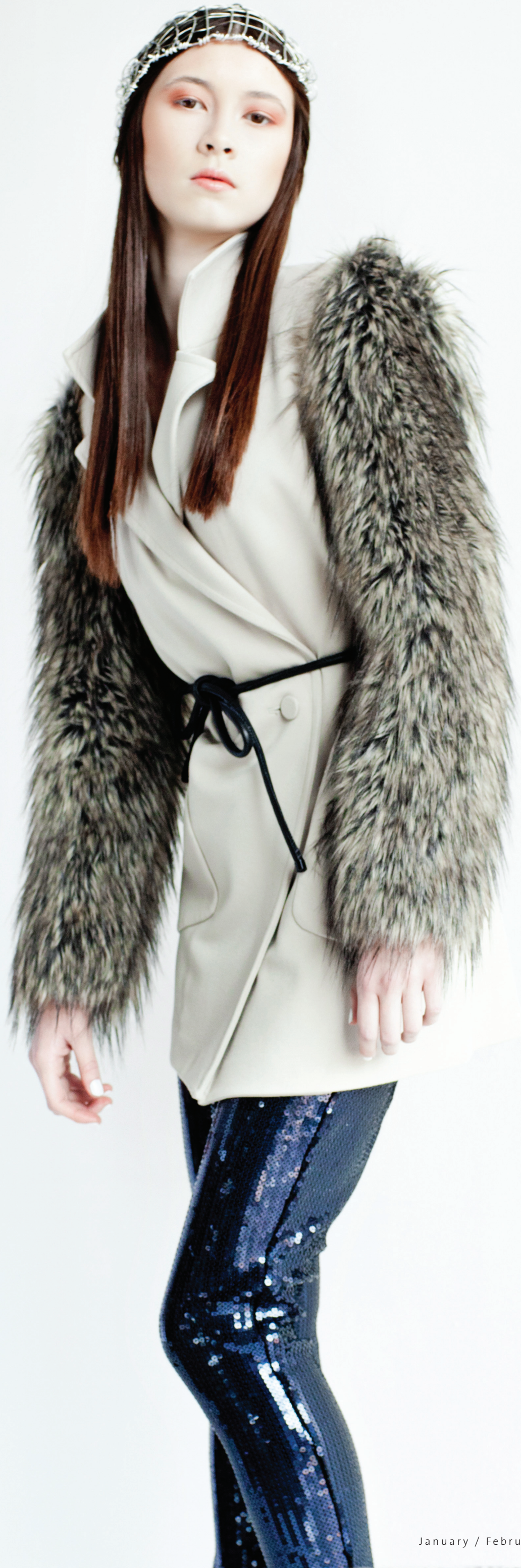
Coat by Robert Rodriguez $695 Pants by Adriano Goldschmied $225