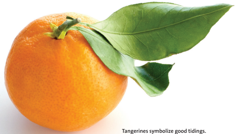
Tangerines symbolize good tidings.

Everyone knows that fruits are rich in antioxidants and that nuts and seeds have beneficial fats and enzymes. And fresh cut flowers will brighten the moods of those in their presence. What may be less known is that during Lunar New Year, many of the fruits, nuts, seeds, and flowers import more powerful—and traditional—benefits.