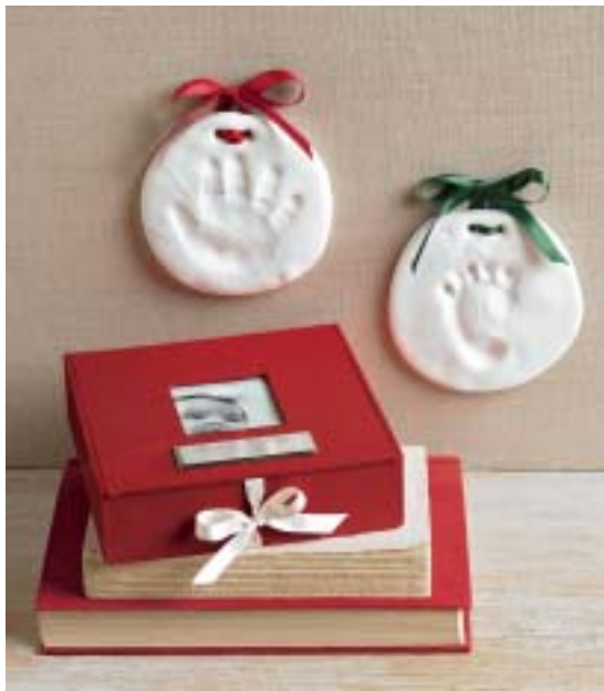
Baby's First Christmas Ornament Kit $30, redenvelope.com