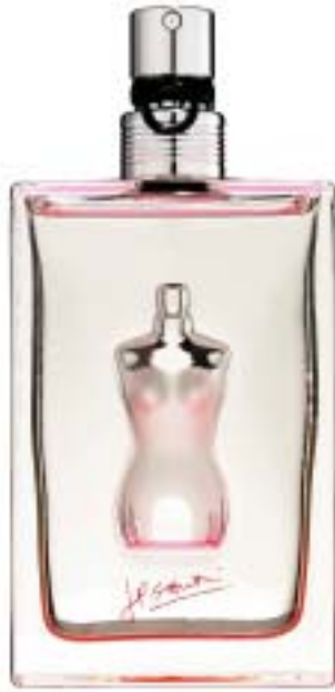
Jean Paul Gaultier – Ma Dame $42 - $87 sephora.com