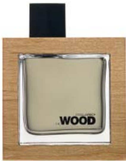
Dsquared2 – He Wood $40 - $80 sephora.com

The season's hottest fragrances for men and women not only smell divine but look it as well. Stylish and distinctive – these fashionable scents add instant chic to any fragrance lover.