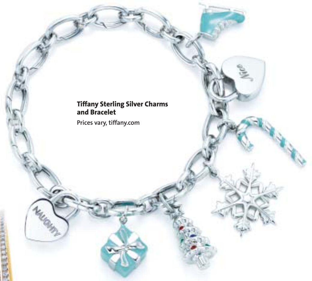
Tiffany Sterling Silver Charms and Bracelet Prices vary, tiffany.com