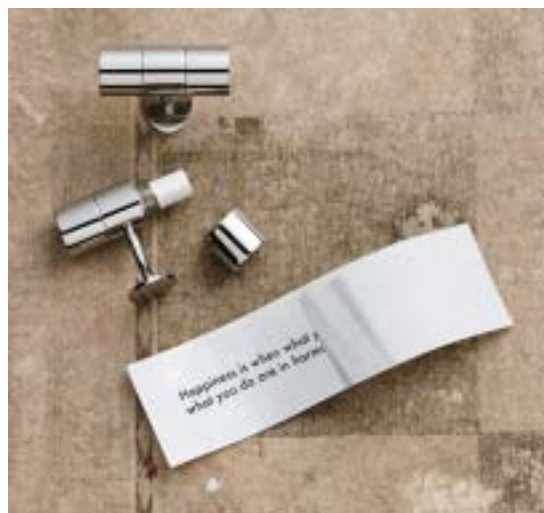
Secret Message Cufflinks $50, redenvelope.com