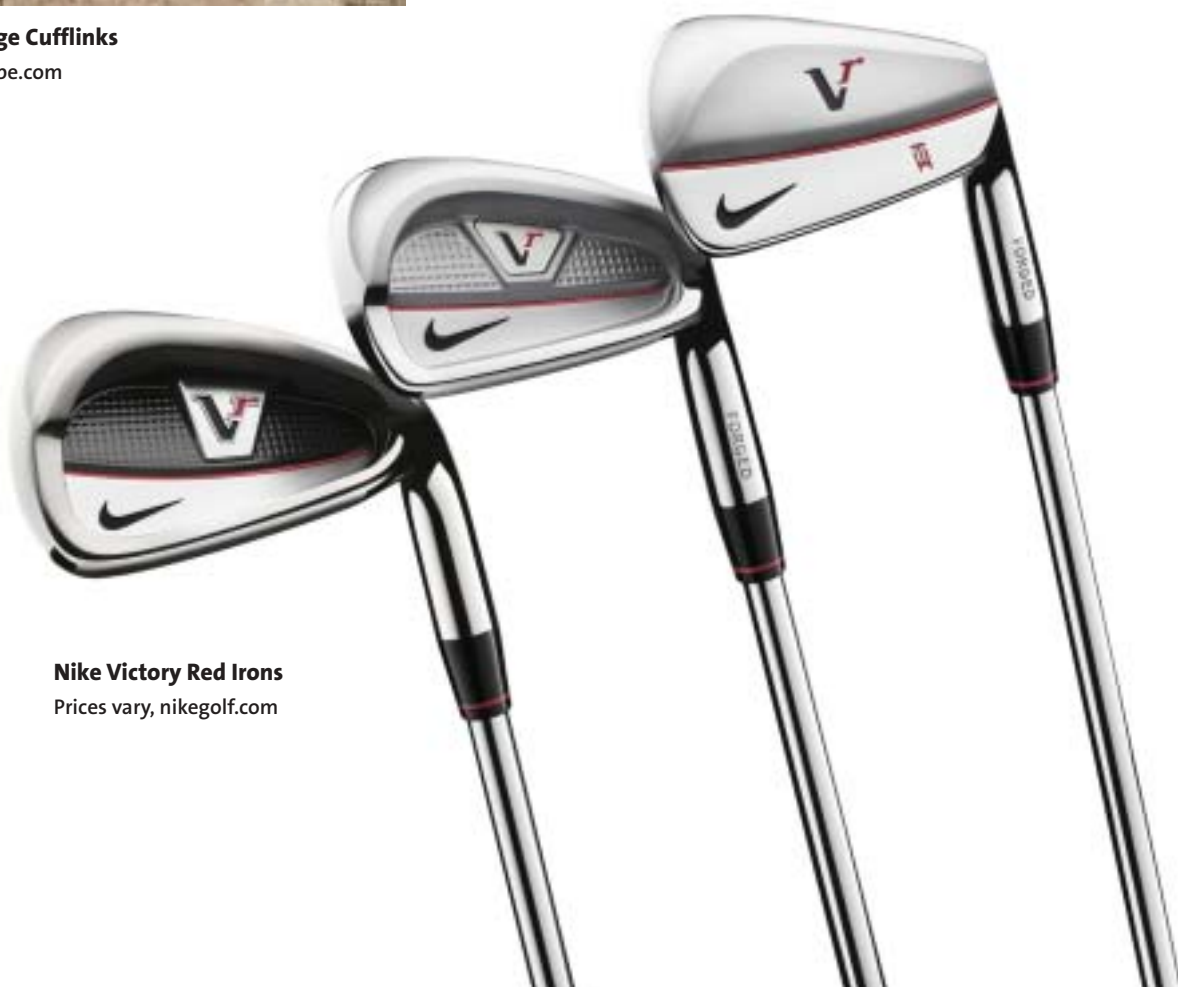
Nike Victory Red Irons Prices vary, nikegolf.com