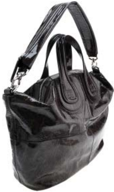
Givenchy Medium Patent Nightingale Bag $1695, barneys.com

Yellow Magazine's essentials gift guide range from modern and quirky home accessories to playfully chic items for the whole family. With these fantastic gift ideas, finding the perfect present during this holiday season has never been so effortless.