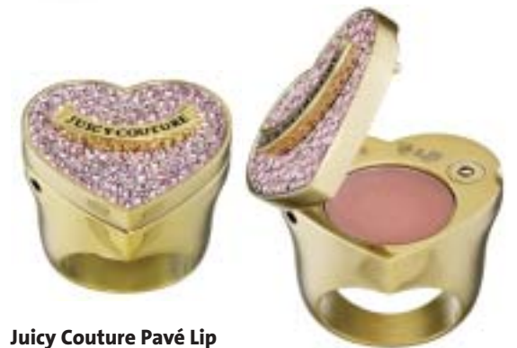
Juicy Couture Pavé Lip Gloss Heart Ring $68, sephora.com