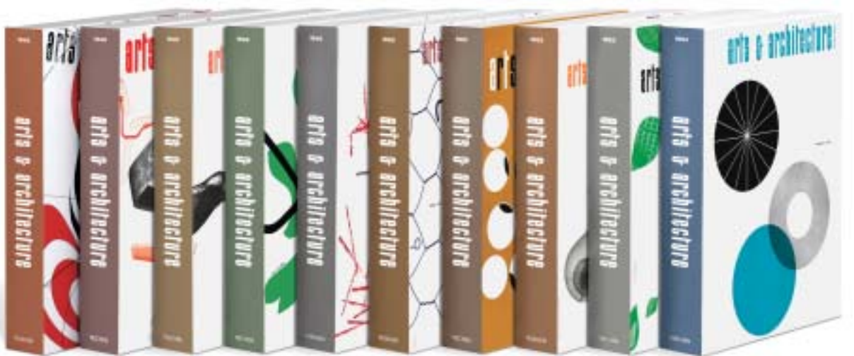
Arts & Architecture 1945-54: The Complete Reprint $700, dwr.com