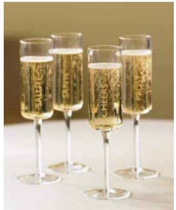
Cheers Champagne Flutes $50, redenvelope.com