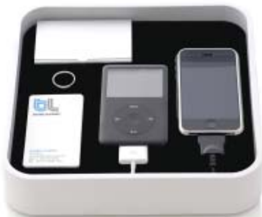
Sanctuary Charging Station $130, redenvelope.com