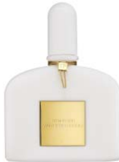
Tom Ford – White Patchouli $60 - $138 sephora.com