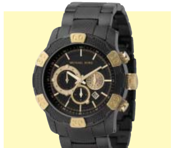
Michael Kors Chronograph Watch with Gold Trim $275, michaelkors.com