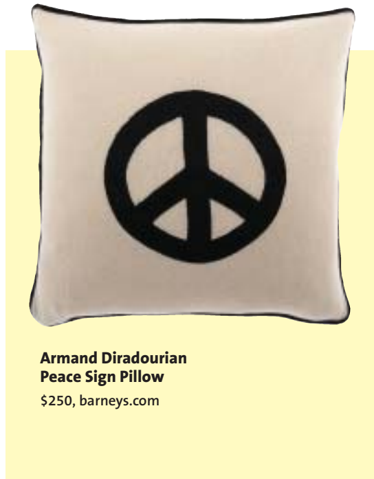
Armand Diradourian Peace Sign Pillow $250, barneys.com