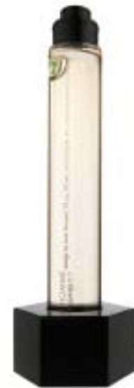
Yves Saint Laurent – L'Homme Limited Edition $79.50 sephora.com