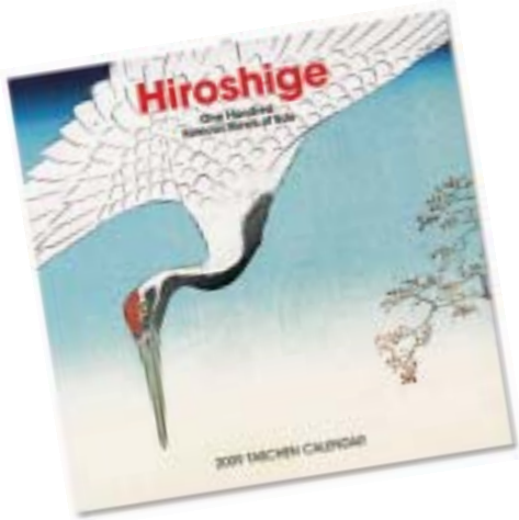
Hiroshige 2009 Wall Calendar $14, taschen.com