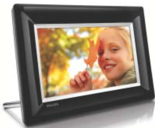
Philips Digital PhotoFrame™ Display $89-$139, philips.com