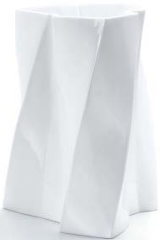
Frank Gehry Torque Vase $195, tiffany.com