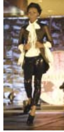
Fashion show models