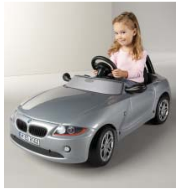
BMW Z4 Roadster $675, neimanmarcus.com