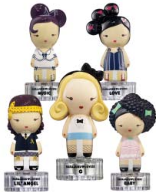
Harajuku Lovers $25 - $45 sephora.com

Enjoying the Ho Ho Ho's Without the No No No's