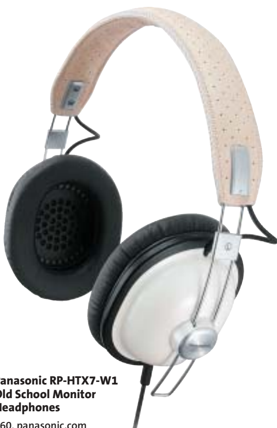
Panasonic RP-HTX7-W1 Old School Monitor Headphones $60, panasonic.com