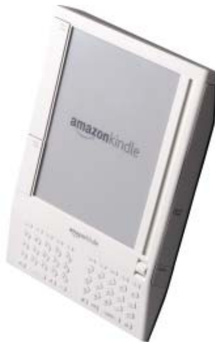
Kindle Wireless Reading Device $359, amazon.com