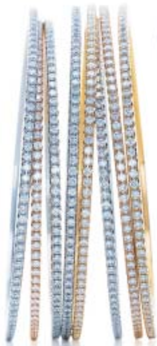
Tiffany Metro Bangles $5800, tiffany.com