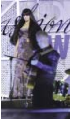
Fashion show model