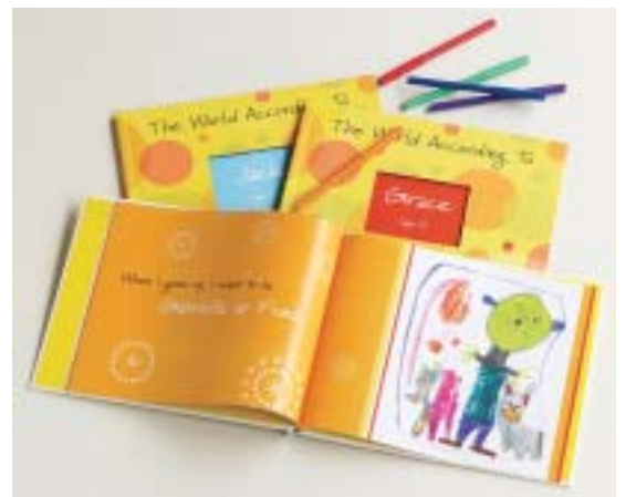
The World According to Me Book Kit $50, redenvelope.com